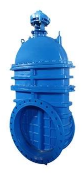
LARGE DIAMETER METAL SEATED GATE VALVE DN700-DN2000,PN10/16/25