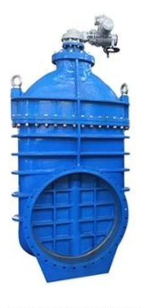
METAL SEATED GATE VALVE DN350-DN600,PN10/16/25