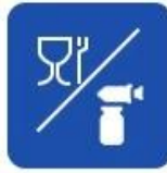
Food and drug