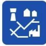
Water supply and drainage