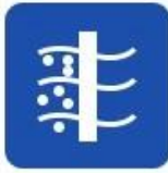
Sea water desalination