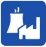
Industrial water application